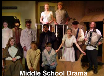
Middle School Drama

Your child's experience will be highly personal and focused.